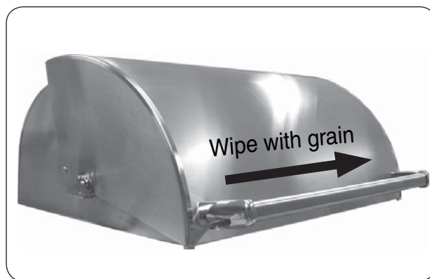
Fig. 7-1 - Wipe with grain

By following these recommendations, you will enjoy the beauty and convenience of your appliance for many years to come.