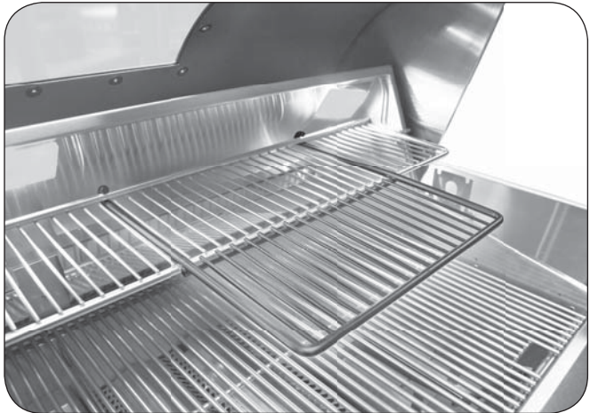
Fig. 1-2 Warming rack extender in place