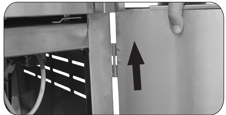
Fig. 1-1 Remove cabinet door

Installation continued on the following page.