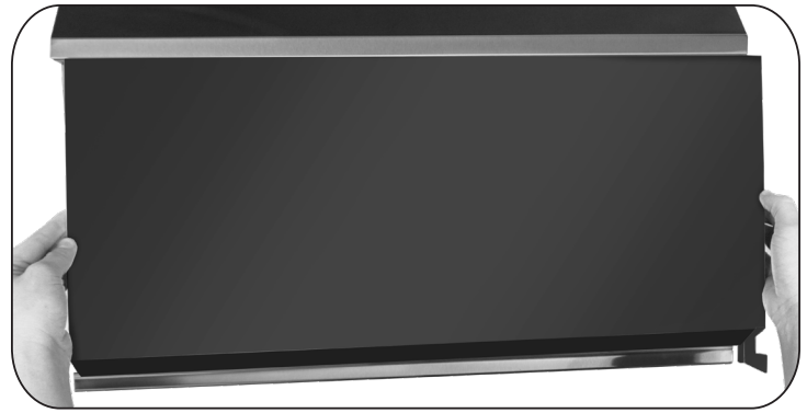
Fig. 2-1 Place accent color panel

Use a soapy water solution and a clean cloth to remove grease and dirt from the surface of the accent color panels.