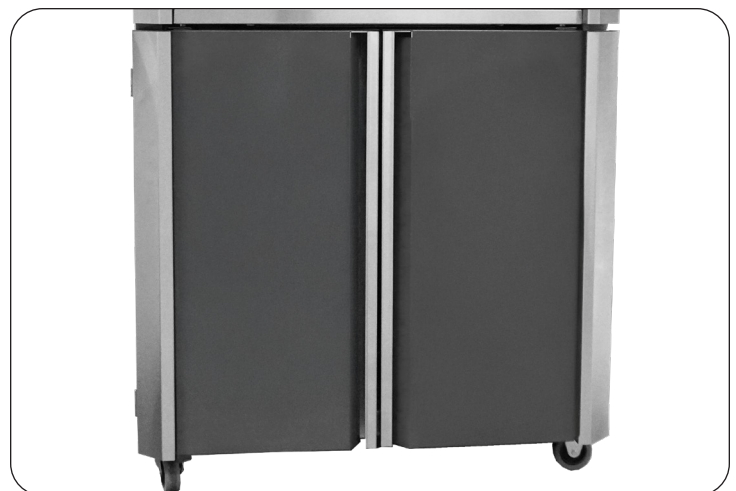
Fig. 2-4 Installation complete