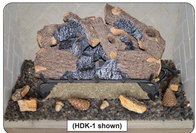
Fig. 1-1 Place cones/chips/acorns around front and sides of burner

If your kit includes additional items, continue to the next page