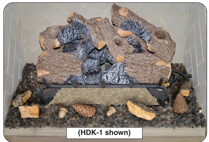
Fig. 1-1 Place cones/chips/acorns around front and sides of burner

If your kit includes additional items, continue to the next page