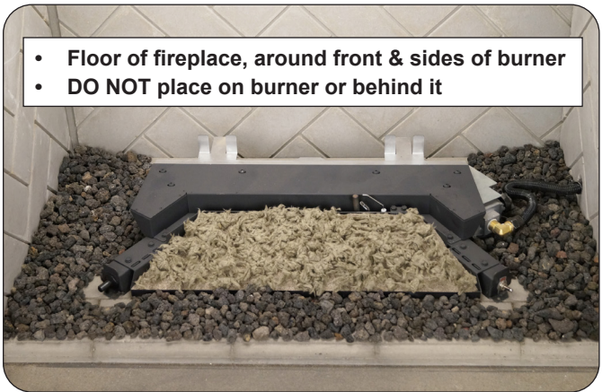
Fig. 2-2 Place lava media

If your kit includes glowing embers, bryte coals, or lava granules/coals, see Fig. 2-3 and Fig. 2-4, and refer to the owner's manual supplied with your burner system for complete installation details.