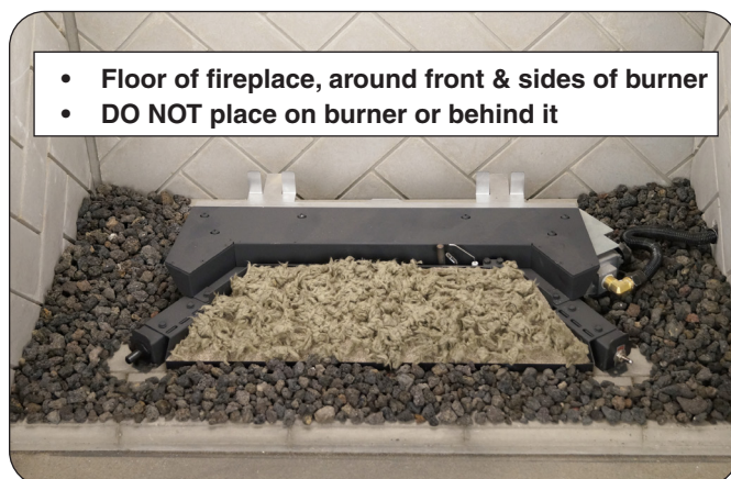
Fig. 2-2 Place lava media