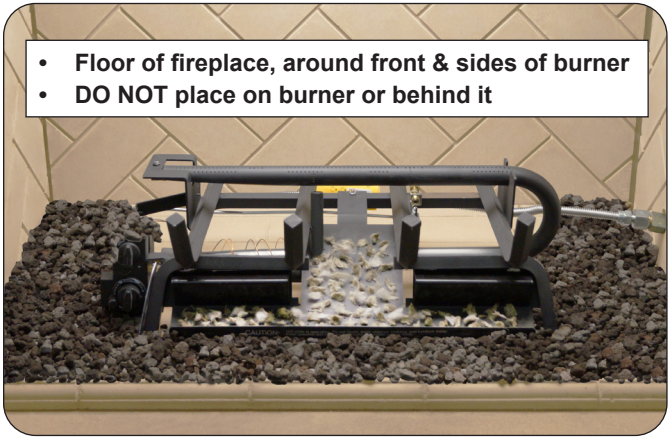
Fig. 2-4 Place lava media