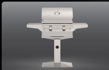
In-Ground or Patio Post Mount